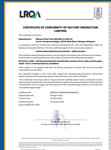
UK Factory Production Control Certificate EN 10219-1:2006 for Cold Formed Welded Structural Hollow Sections of Non-Alloy Steels