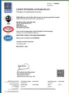
MS 61386-21 : 2010 for Rigid Steel Conduit for Cable Management