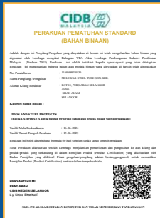
CIBD Registered Products • Rigid Steel Conduit for Cable Management • Steel Conduit for Electrical Wiring • Steel Pipes for Water and Sewerage • Steel Tube for Metal Scaffolding • Welded Steel Pipes