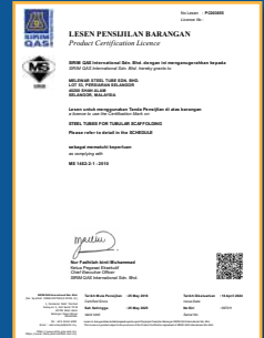
MS 1462-2-1 : 2010 for Steel Tubes for Tubular Scaffolding