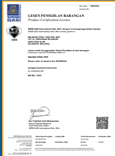
MS 863 : 2010 for Welded Steel Pipe