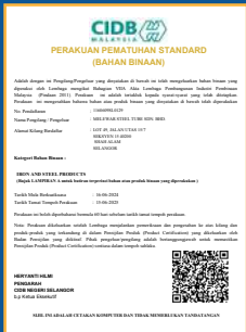
CIBD Registered Products • Cold Formed Welded Structural Hollow Sections