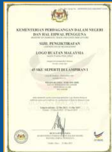
Ministry of Domestic Trade and Consumer Affairs LOGO BUATAN MALAYSIA Certificate for AURORA Conduits and Cold Rolled products