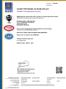
SPAN TS 21827 : PART 2: 2013 for Non Alloy Steel Tube for Water and Sewerage