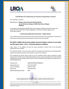
EC Factory Production Control Certificate EN 10219-1:2006 for Cold Formed Welded Structural Hollow Sections of Non-Alloy Steels