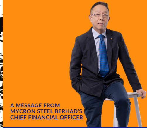
A MESSAGE FROM MYCRON STEEL BERHAD'S CHIEF FINANCIAL OFFICER